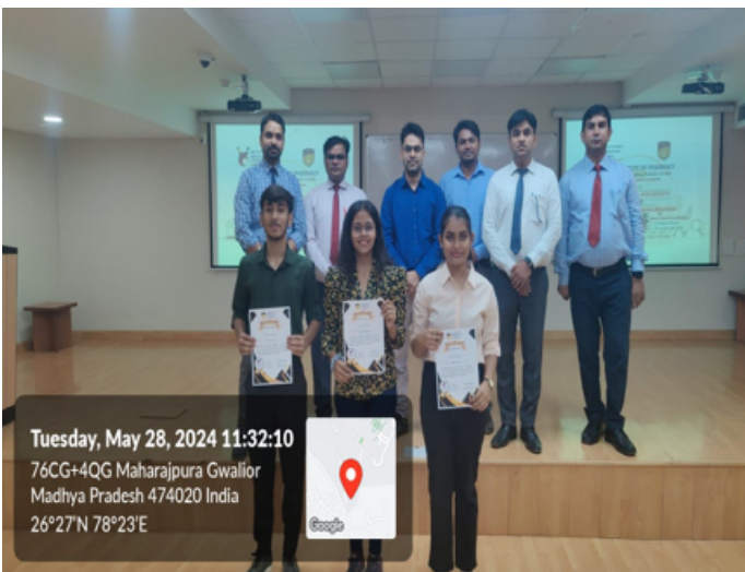
Winners of Essay writing competition