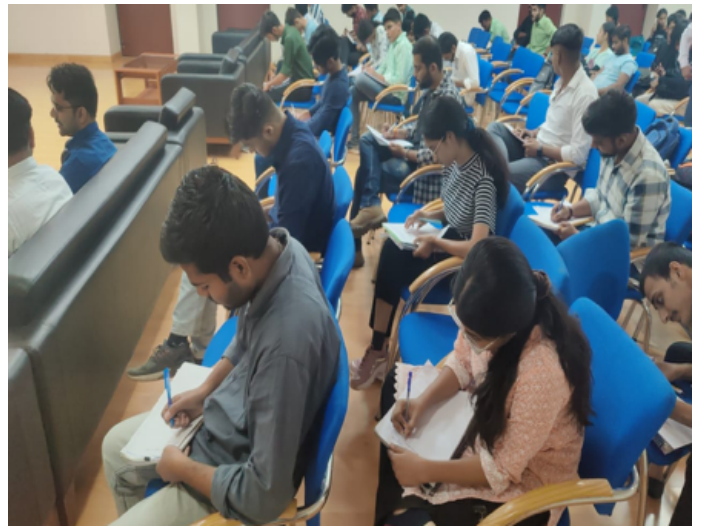
Essay writing on IPR by B Pharm Students