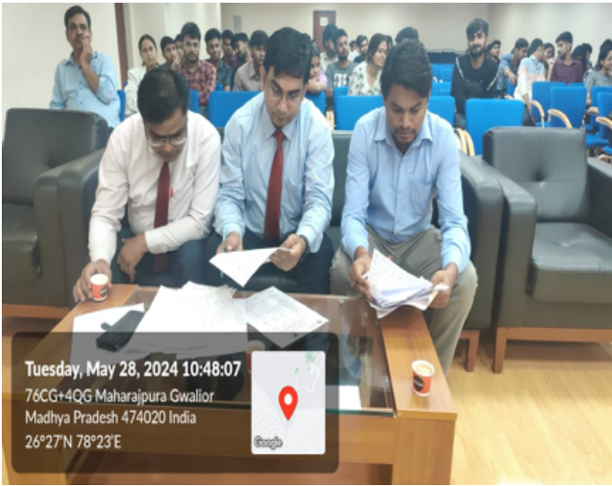
Evaluation of essays written by students