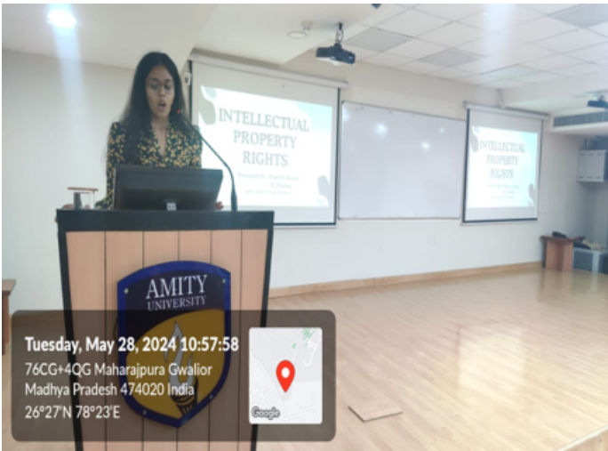
Participation of students in Elocution competition