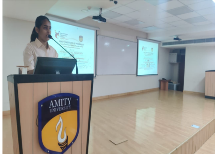
Participation of students in Elocution competition